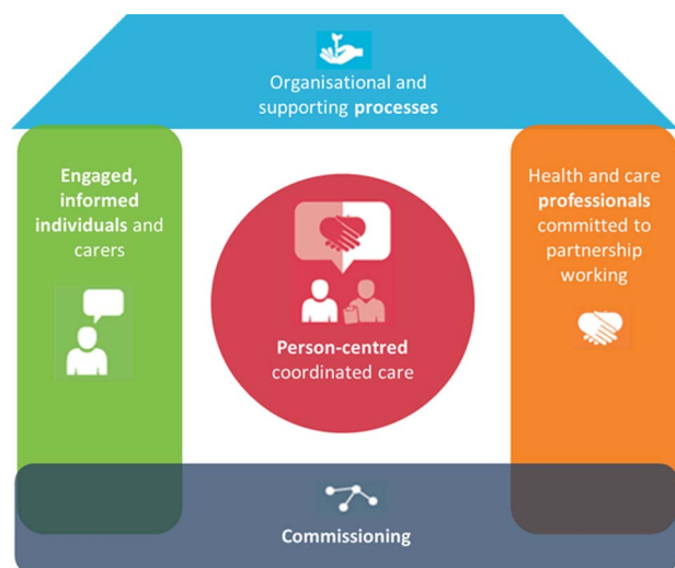
Figure 1 The House of Care Model (NHS England).

while focusing more on enabling patients to make informed decisions by maximising shared decision-making and utilising patient feedback measures. Effective SMS, therefore, requires listening to the patient voice, to avoid services being implemented that do not actually meet the needs of patients. Although, how much local commissioners are actually listening to the patient voice is unknown.